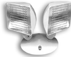
SHOWN: Mounting Plate: PMCW2 Lamp Head: P0607W