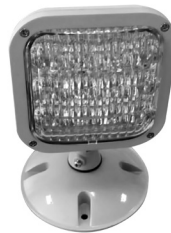
Single lamp with Weatherproof (WP) Option