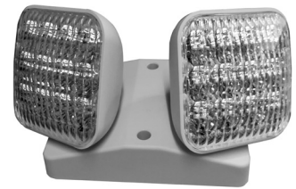
Double lamp with No Options